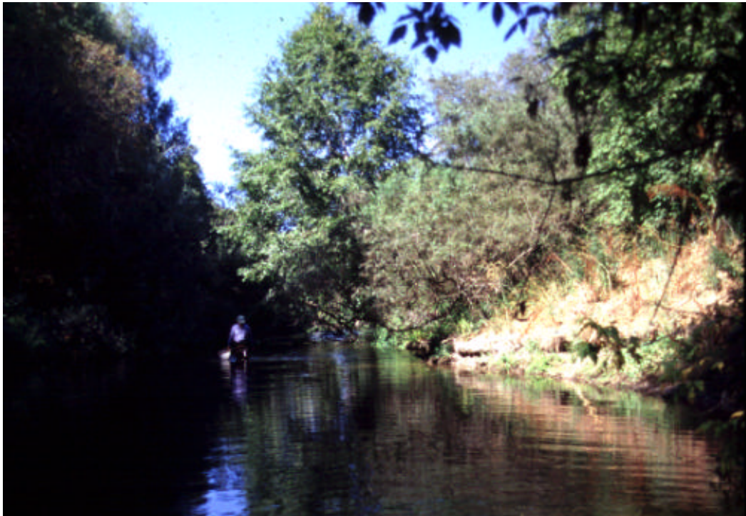
Photo 2: Sampled shrimp pool, Lagunitas Creek at MP 12.91 (below Gallagher), 12 Aug. 1997