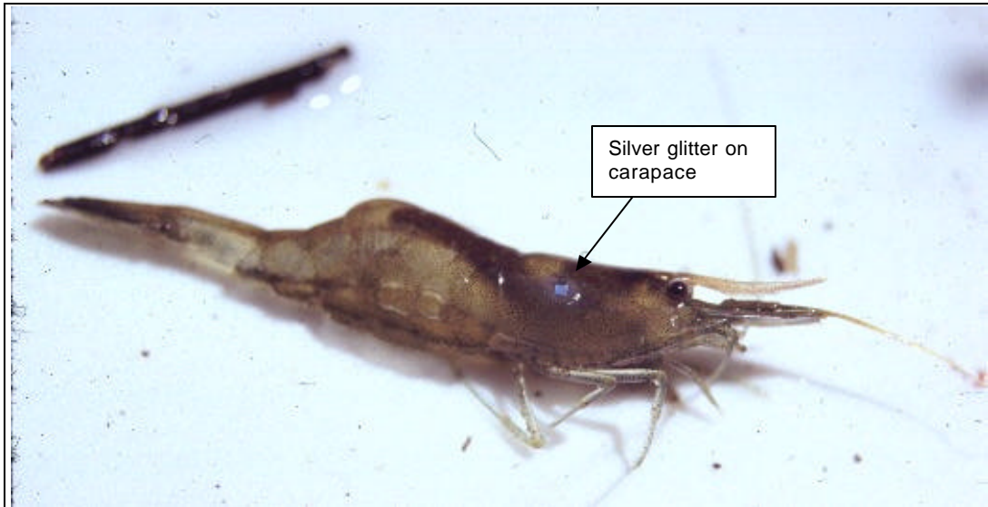
Figure 6: California freshwater shrimp marked with glitter, Lagunitas Creek, Marin Co., August 11, 1997

Pools with the marked shrimp were resampled using the same level of effort within 4 days. Shrimp were examined for marks, mark retention, and injuries. Possible injuries associated with marking and sampling activities were recorded along with a statement of the probable cause.