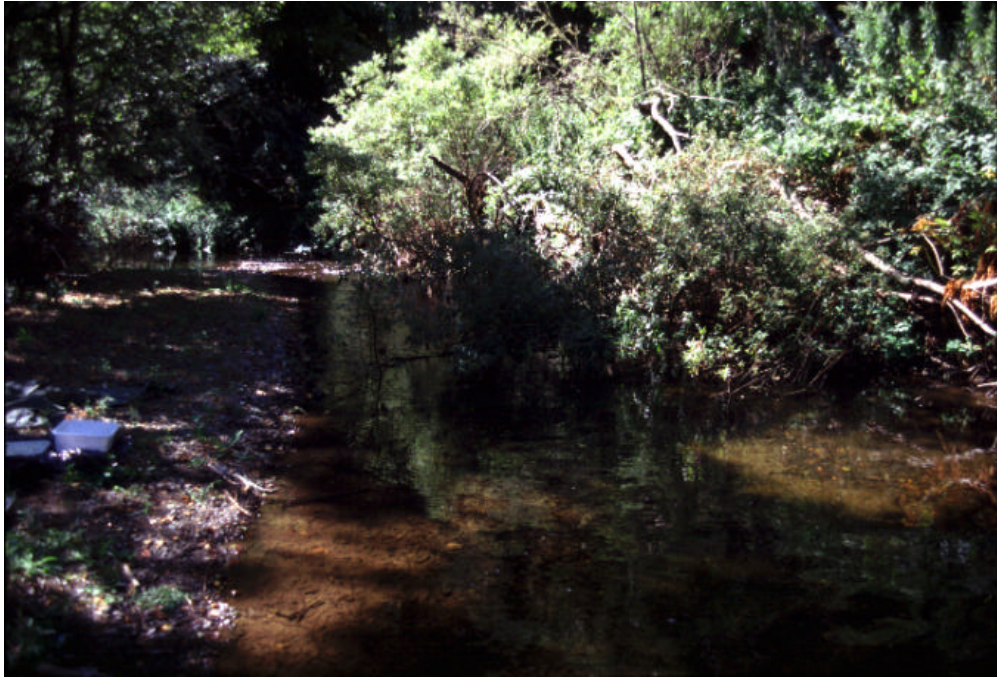
Photo 1: Sampled shrimp pool, Lagunitas Creek at MP 19.94 (above Tocaloma), 11 Aug. 1997