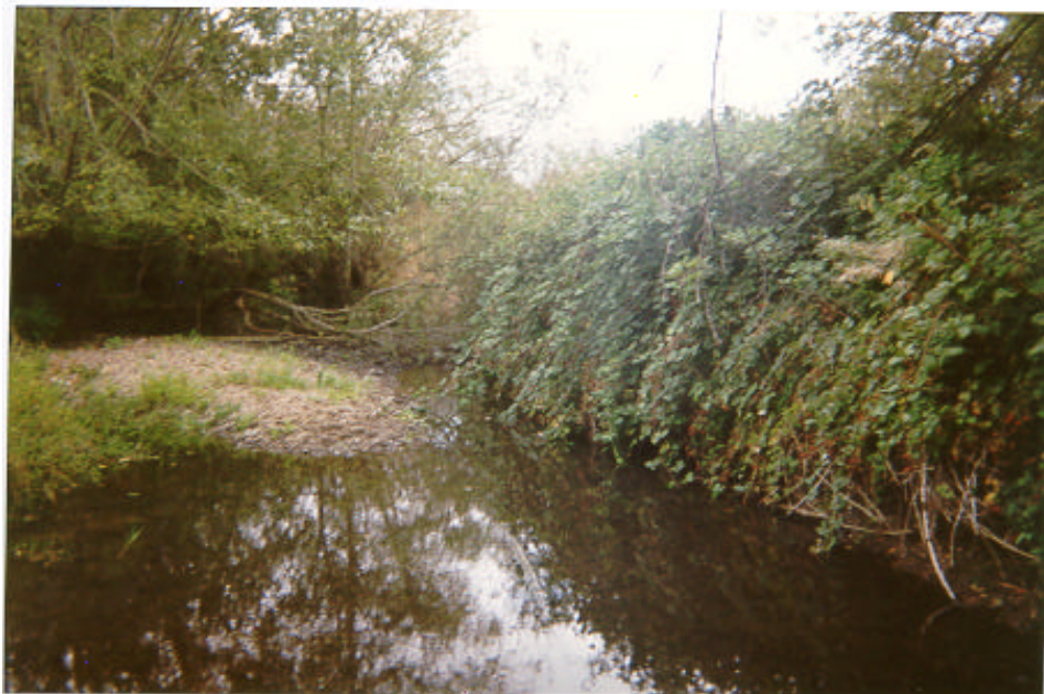
Picture 3: Shrimp-bearing pool on Olema Creek (approx. 600 m above confluence with Lagunitas Creek), 15 Aug. 1997. Shrimp found in overhanging blackberry